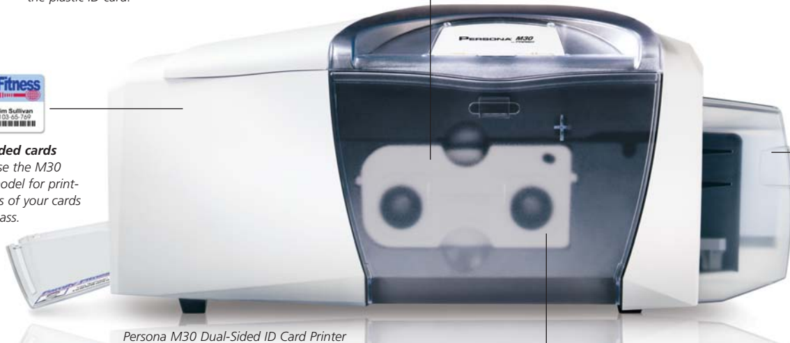
Persona M30 Dual-Sided ID Card Printer

Print two-sided cards faster. Choose the M30 Dual-Sided model for printing both sides of your cards in one easy pass.